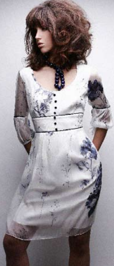
SS0852 Silk print wedgwood floral dress with balloon sleeve, piping and buttons (Wedgwood Floral Print)