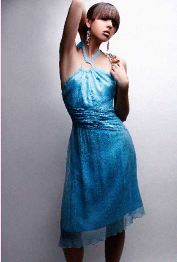
SS0802 Crinkle silk dress with rouchéd bodice and silver ring (Turquoise, Melon, Champagne, Leaf, Black, White)