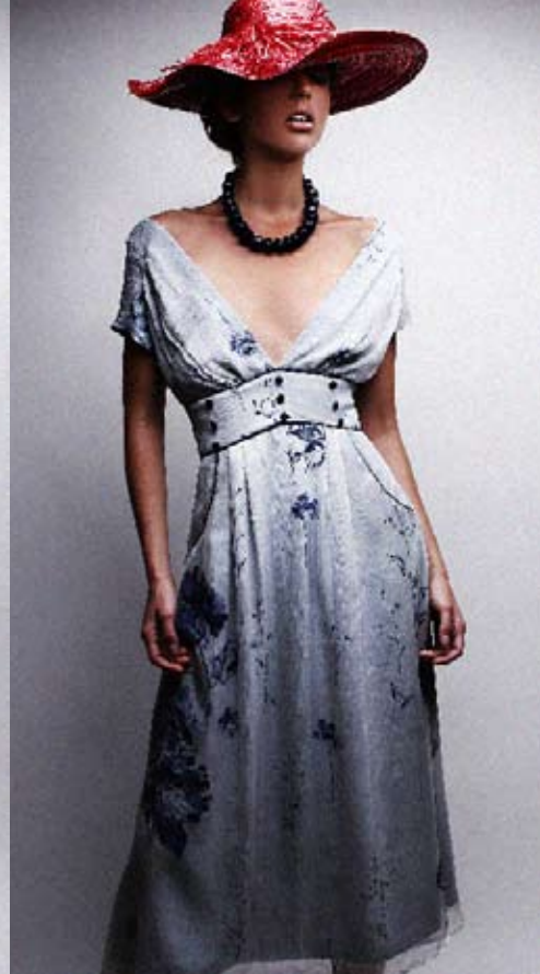
SS0851 Silk print wedgwood floral cap sleeve dress with navy piping and buttons (Wedgwood Floral Print)