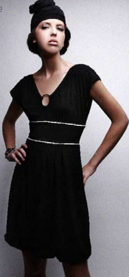
SS0844 Jersey dress with bubble hem, silver ring and piping detail (Blk/Wh, Turq/Wh, Melon/Wh)