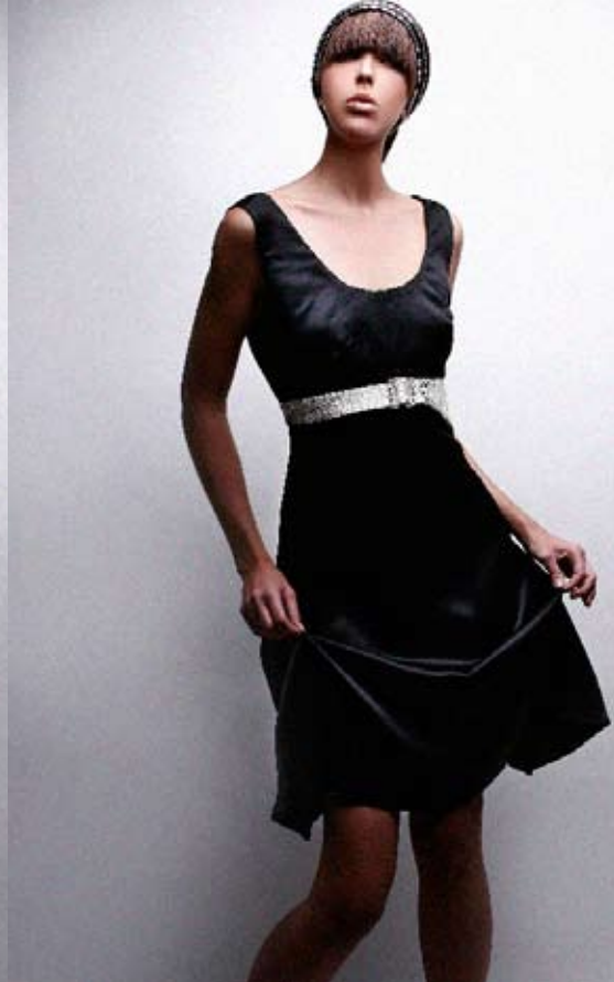
SS0805 Silk satin dress with low back and contrast beaded belt (Black, Silver, Wedgwood, Mint, Lilac)