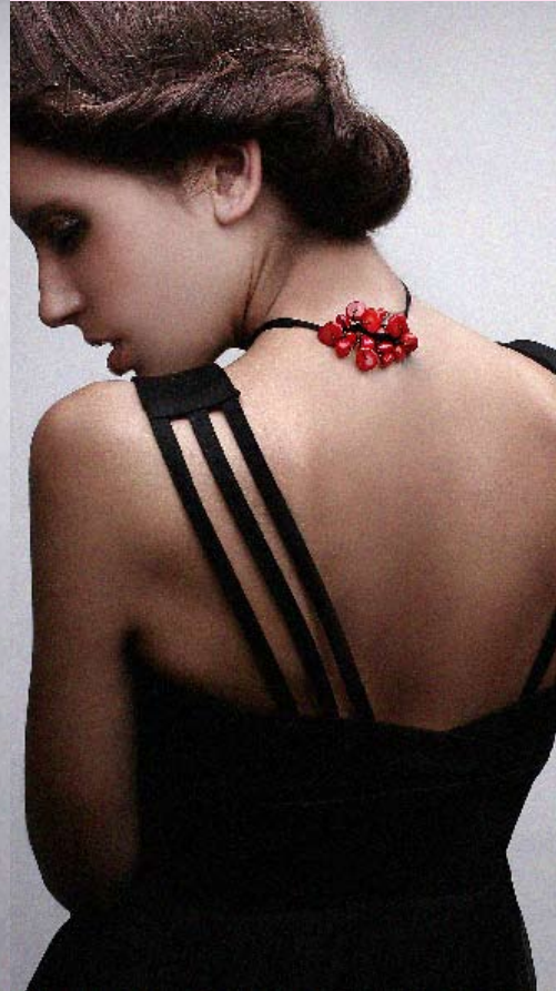
SS0801 Dress with stretch bodice and silk skirt (Black, Crystal)