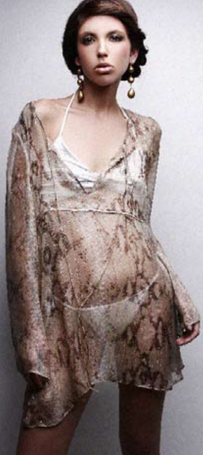
SS0808 Silk caftan with piping detail (Snake/Gold)