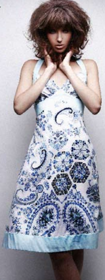
SS0832 Cotton or silk dress with contrast bands and straps (Pink Print, Blue Print)