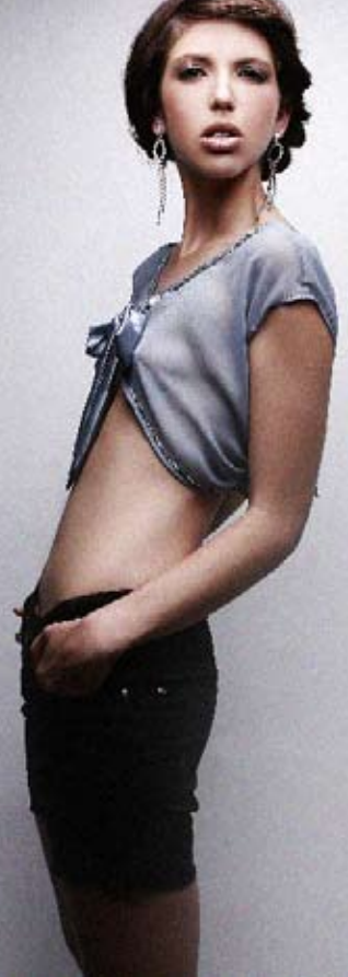
SS0821 Silk georgette capelet with bead detail (Wedgwood, Silver, Black, Red, White, Mint, Lilac, Crystal) SS0855 Stretch sateen hot pant (Black, Silver, Gold)