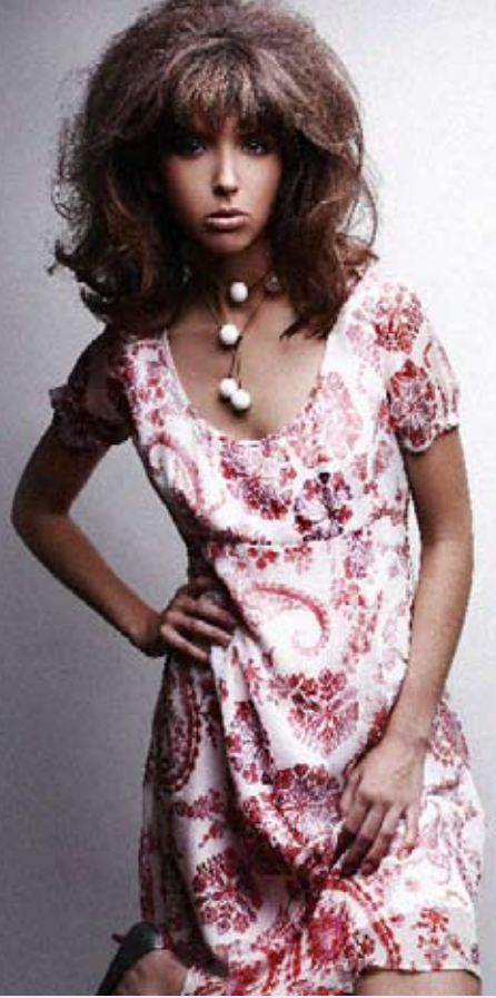
SS0833 Silk or cotton dress with pleated cap sleeve and under bust band (Pink Print, Blue Print)