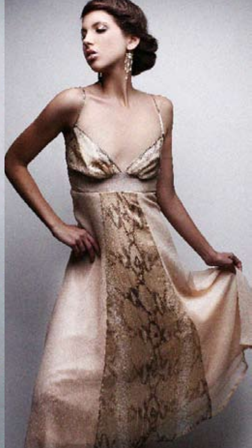
SS0843 Silk georgette dress with crinkle silk and gold band (Snake/Gold/Champagne)