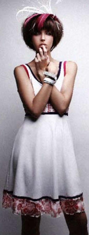
SS0823 Silk and jersey round neck dress with contrast bands (Pink Print, Blue Print)