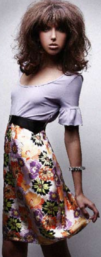
SS0848 Silk print dress with contrast jersey bodice and belt (Orange Print)