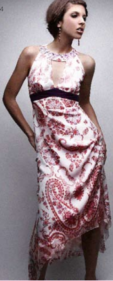
SS0822 Silk or cotton halter dress with thick beaded halter strap (Pink Print, Blue Print)