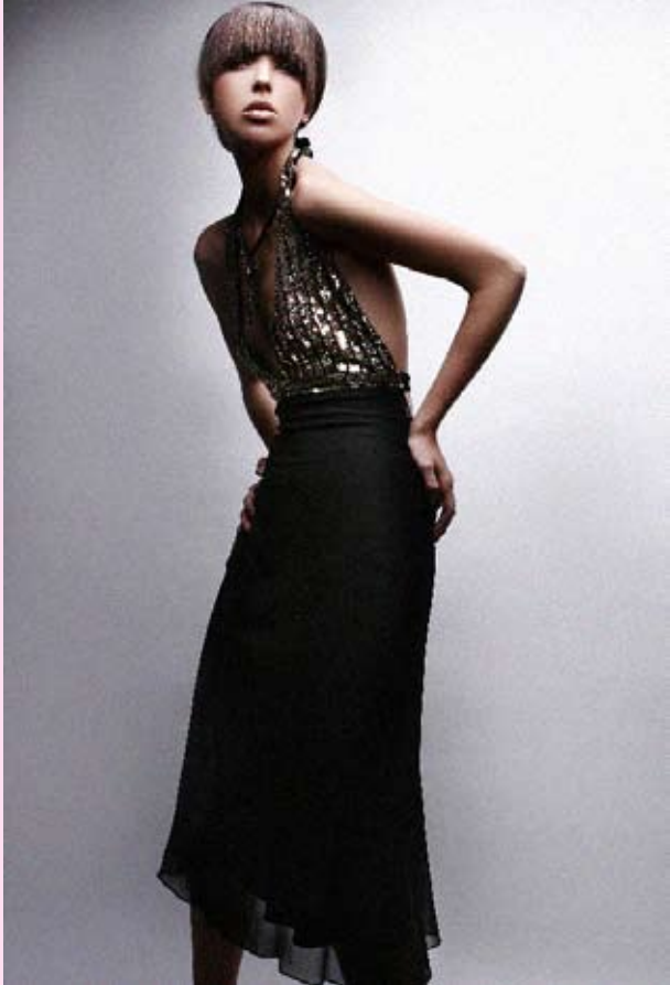
SS0857 Cocktail length silk georgette dress with beaded bodice (White, Black, Red, Silver, Aqua, Wedgwood)