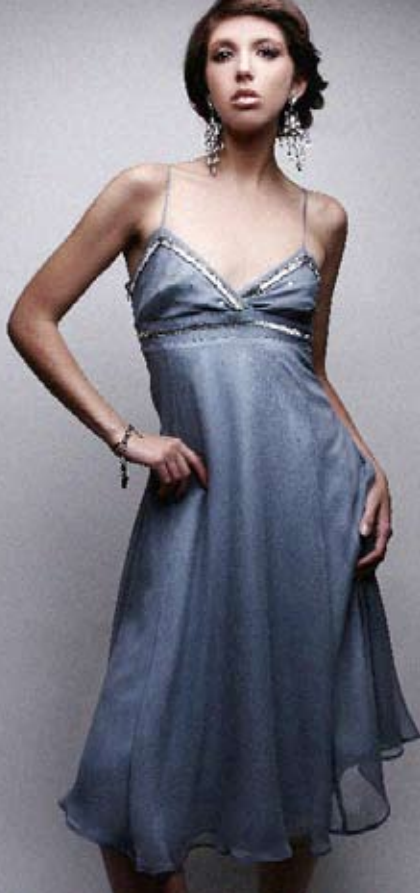
SS0820 Silk georgette cocktail dress with bead detail (Wedgwood, Crystal, Red, Silver, Black, White)