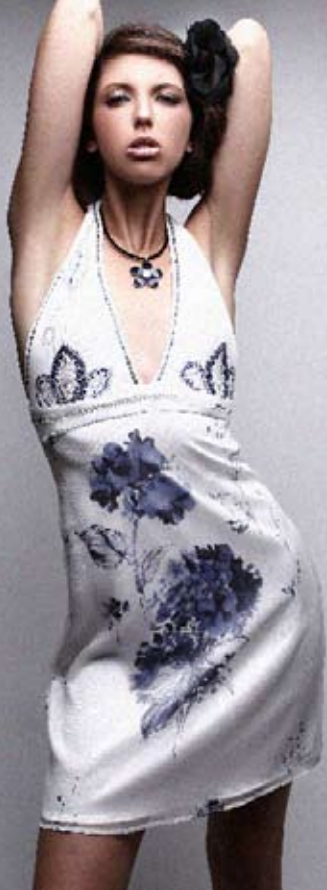
SS0850 Silk print wedgwood floral short dress with beaded jersey bodice (Wedgwood Floral Print)