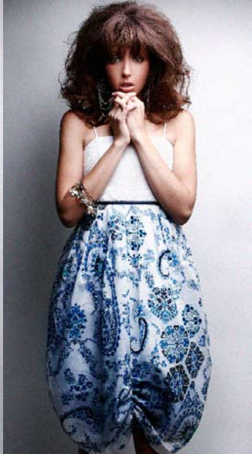
SS0826 Cotton or silk dress gathered onto jersey bodice with ribbon detail (Blue Print, Pink Print)