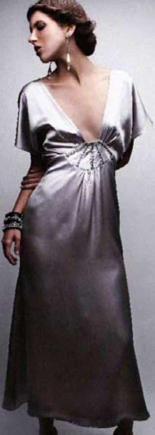
SS0829 Long silk dress with low front and back (Wedgwood, Silver, Mint, Lilac, Black)