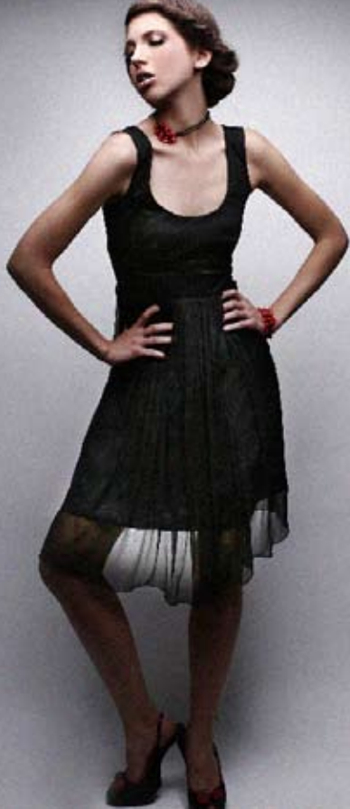
SS0801 Dress with stretch bodice and silk skirt (Black, Crystal)