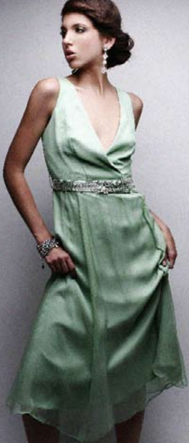
SS0836 Crinkle silk cross front dress with beaded belt (Leaf, Melon, White, Black, Turquoise, Champagne)