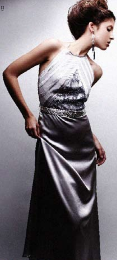
SS0817 Long silk satin dress with pleated bodice and beaded belt (Silver/Charcoal)