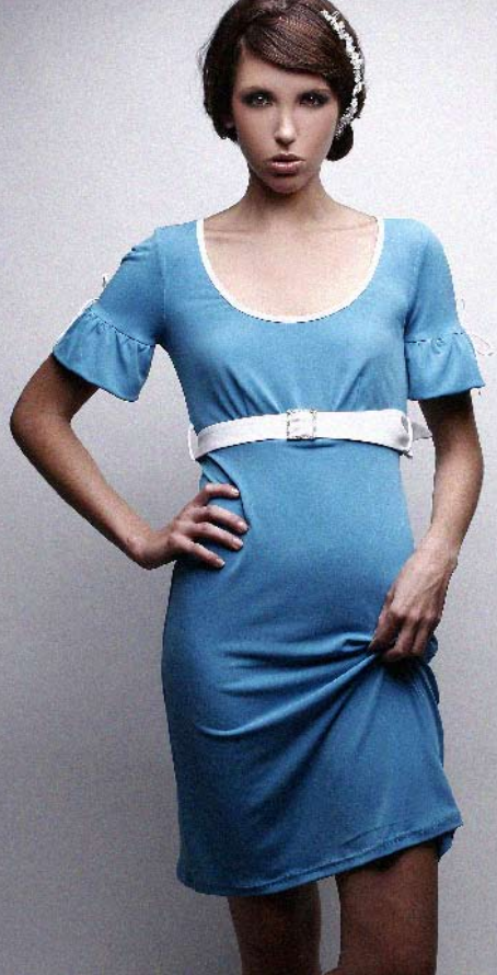
SS0862 Jersey dress with gathered cap sleeve and contrast belt (Turquoise/White, Melon/White, Black/White, Hot Pink/White)