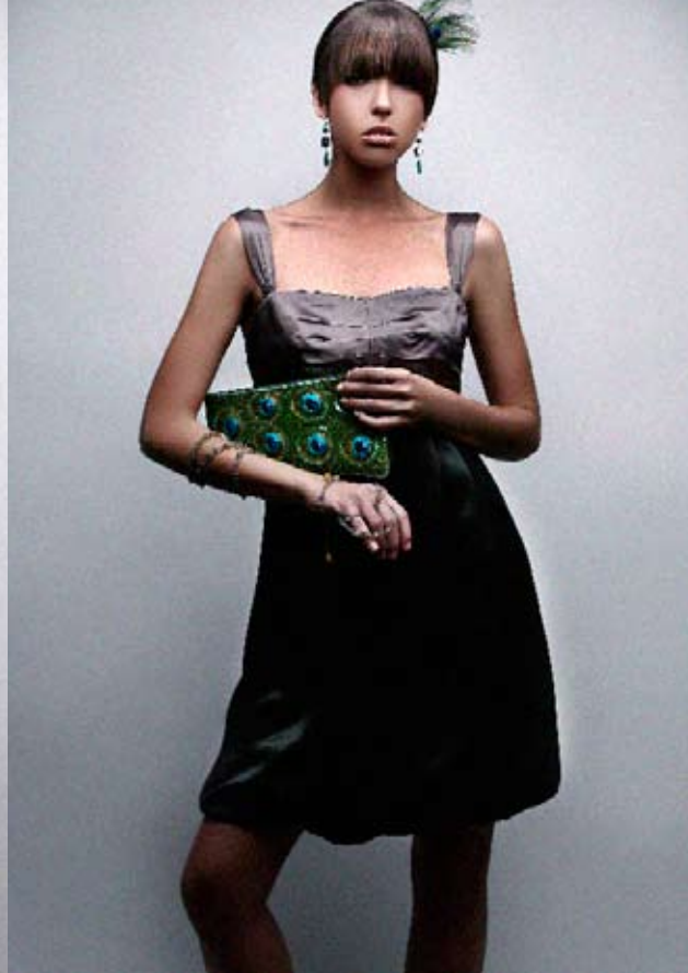
SS0804 Dress with stretch satin bodice, piping and bubble hem (Blk/Mocca, Blk/Silver)