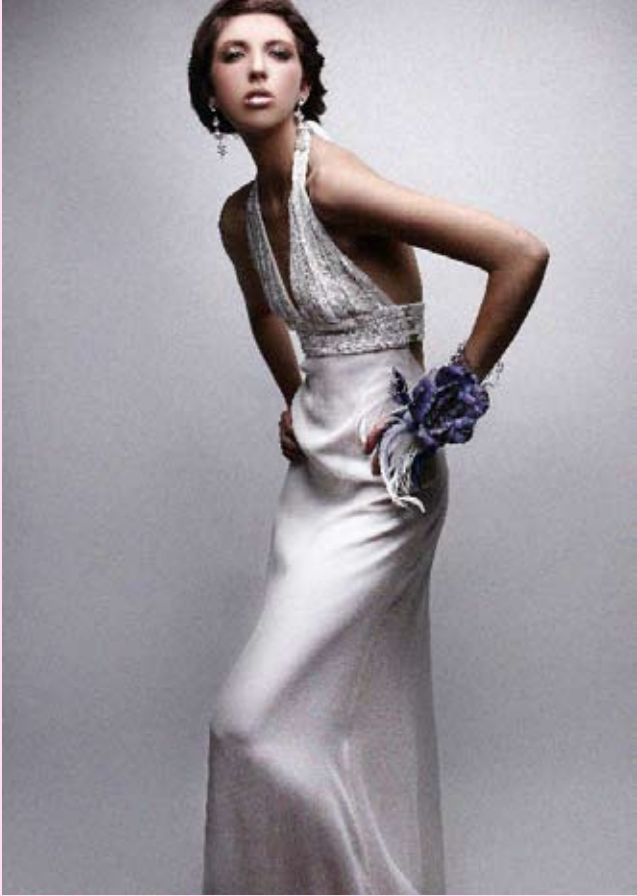
SS08185 Long silk georgette dress with beaded bodice (White, Black, Red, Silver, Aqua, Wedgwood)