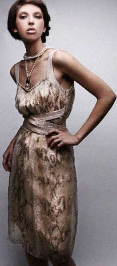
SS0814 Silk chiffon dress with thick gold waist straps (Snake Print)