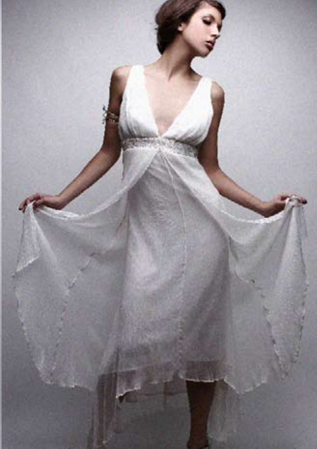
SS0845 Crinkle silk cocktail dress with double layer skirt and beaded band (Melon, Turquoise, Champagne, Black White)