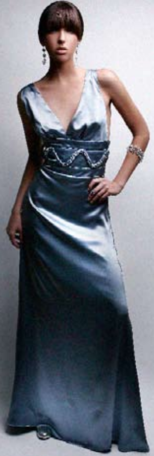
SS0819 Long silk satin dress with plait detail (Black, White, Wedgwood, Silver, Mint, Lilac)