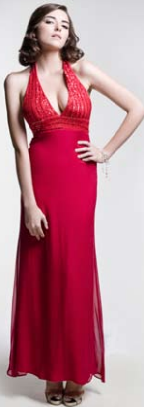
FW89185 Long silk georgette halter dress with beaded bodice (red, black, teal, silver)