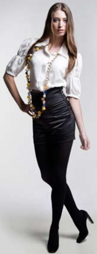
FW8920 Faux fur vest (black) FW8919 Silk jersey short sleeve turtleneck (cream, black) FW8918 Stretch sateen slashed skirt (black, charcoal) FW8934 Tuxedo dress with Swarovski crystal buttons (black, charcoal) FW8923 Silk crepe de chine bubble sleeve shirt ( white, mocha, red, black) FW8927 Stretch sateen high waisted hot pants (charcoal, black)