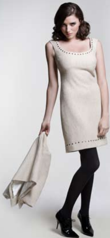
FW8915 Shift dress with metal detail (cream) FW8916 Gathered yoke jacket (cream)