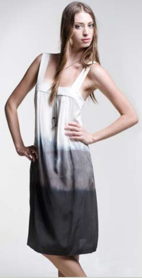
FW8904 Cocktail length crinkle silk asymmetric dress with beaded belt (charcoal, champagne, black, leaf)