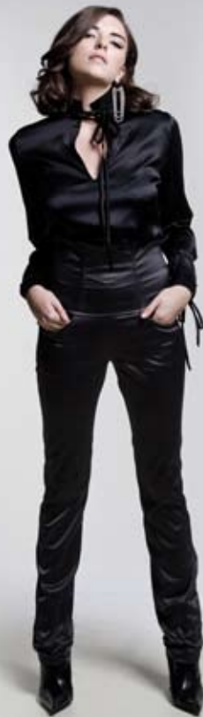
FW8921 Stretch silk satin tie shirt (black, white) FW8931 Stretch sateen high waisted pants (charcoal, black)