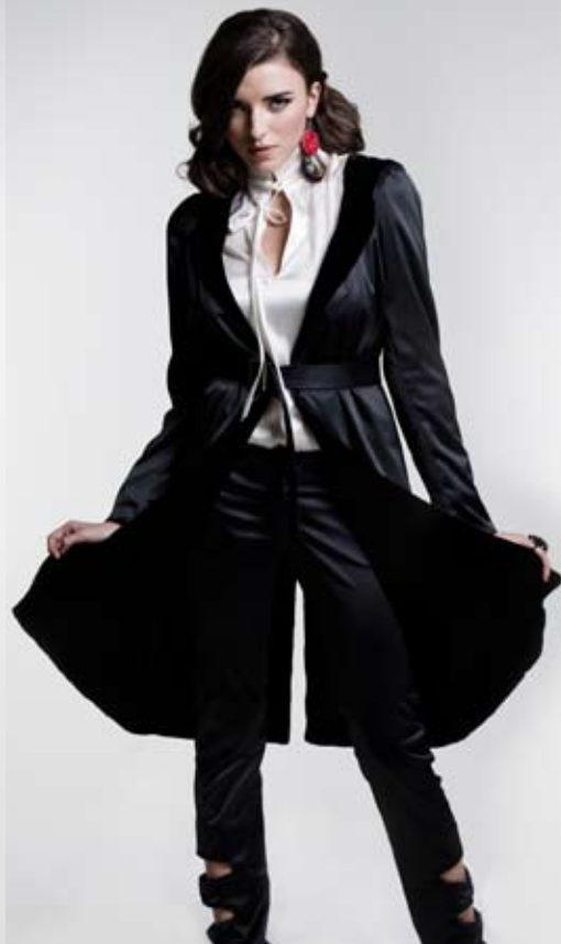
FW8921 Stretch silk satin tie shirt (white, black) FW8922 Stretch sateen slashed dress with piping (black)