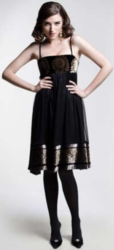
FW8911 Silk velvet print and silk georgette baby doll dress (black/antique)