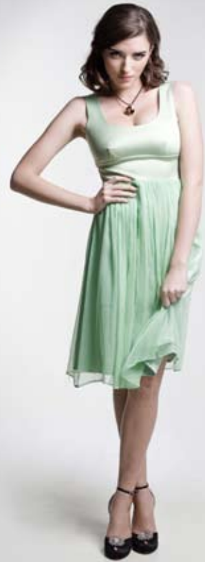
FW8912 Crinkle silk cocktail dress with Swarovski crystal detail (baby pink, white, charcoal, champagne, black)