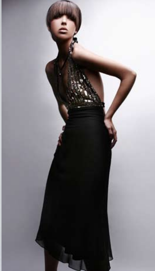
FW8957 Cocktail length silk beaded halter dress (black, red, teal, silver)