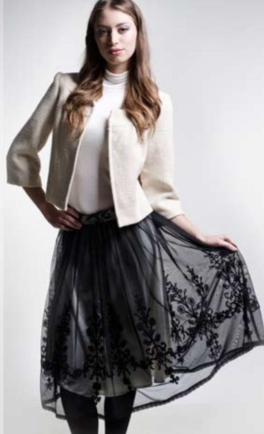
FW8916 Gathered yoke jacket (cream) FW8919 Silk jersey short sleeve turtleneck top (cream, black) FW8928 Embroidered tulle skirt (black)