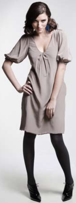
FW8936 Silk crepe de chine full sleeve dress (mocha, white, red, black)