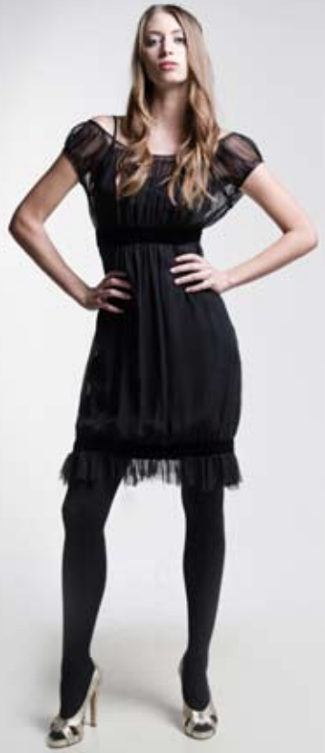
FW8903 Gathered silk georgette dress with velvet trim (black/black, teal/black, red/black)