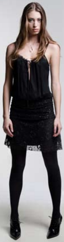
FW8932 Cross front silk and lace mini dress(black, white)