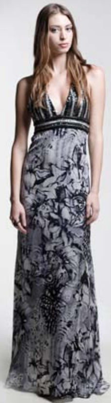
FW8908 Long beaded halter dress (black/ white print)