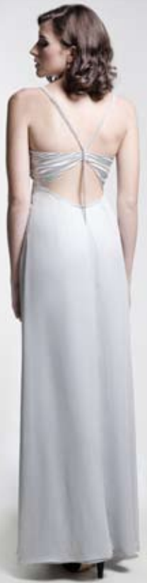
FW8909 Long silk dress with Swarovski crystal strap detail (silver, black, teal, red)